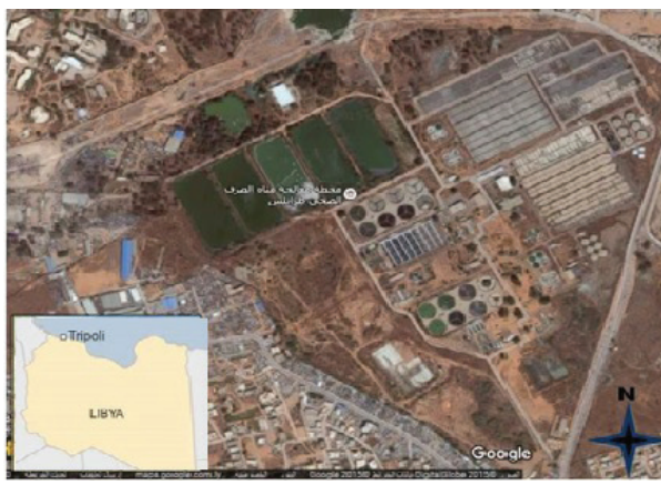
Figure 1: Study Area

of grasses, in addition, the establishment of treatment and purification of waste water plants has led to the creation of new wetlands, which favor growing of some aquatic plants such as Tamarix and Phragmites and other species (Fig 1) [8, 9].