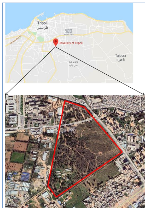
Figure 1. Location of Protected area in the University of Tripoli (Via https://www.Google Earth ).

The study area is located within the University campus, between latitudes ( 32^{\circ} 50' 29.59'' and 32^{\circ} 51' 02.51'' ) North and longitude ( 13^{\circ} 13' 38.44'' and 13^{\circ} 14' 05.99'' ) East with a total area of 35 ha (Fig. 1). The area is characterized by the nature of a different flat land in the rise and it's about 8 Km from the sea, and it rises to about 11m above the sea level. The study area located within the