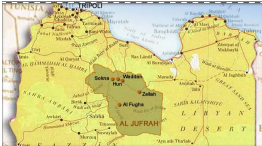
Fig 1: A map of Libya showing the study area (Al-Jufra). ( https://www.libyaobserver.ly ).